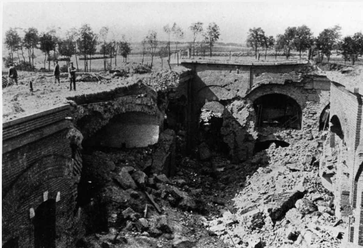
September 1914